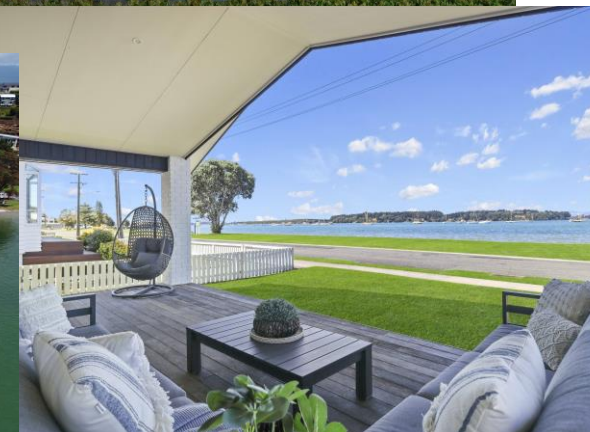
C-Suite lifestyles in Omokoroa