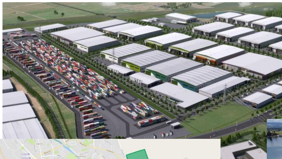
Centralised warehousing in Ruakura